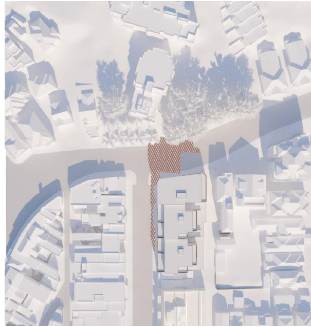
Winter Equinox 1.30pm